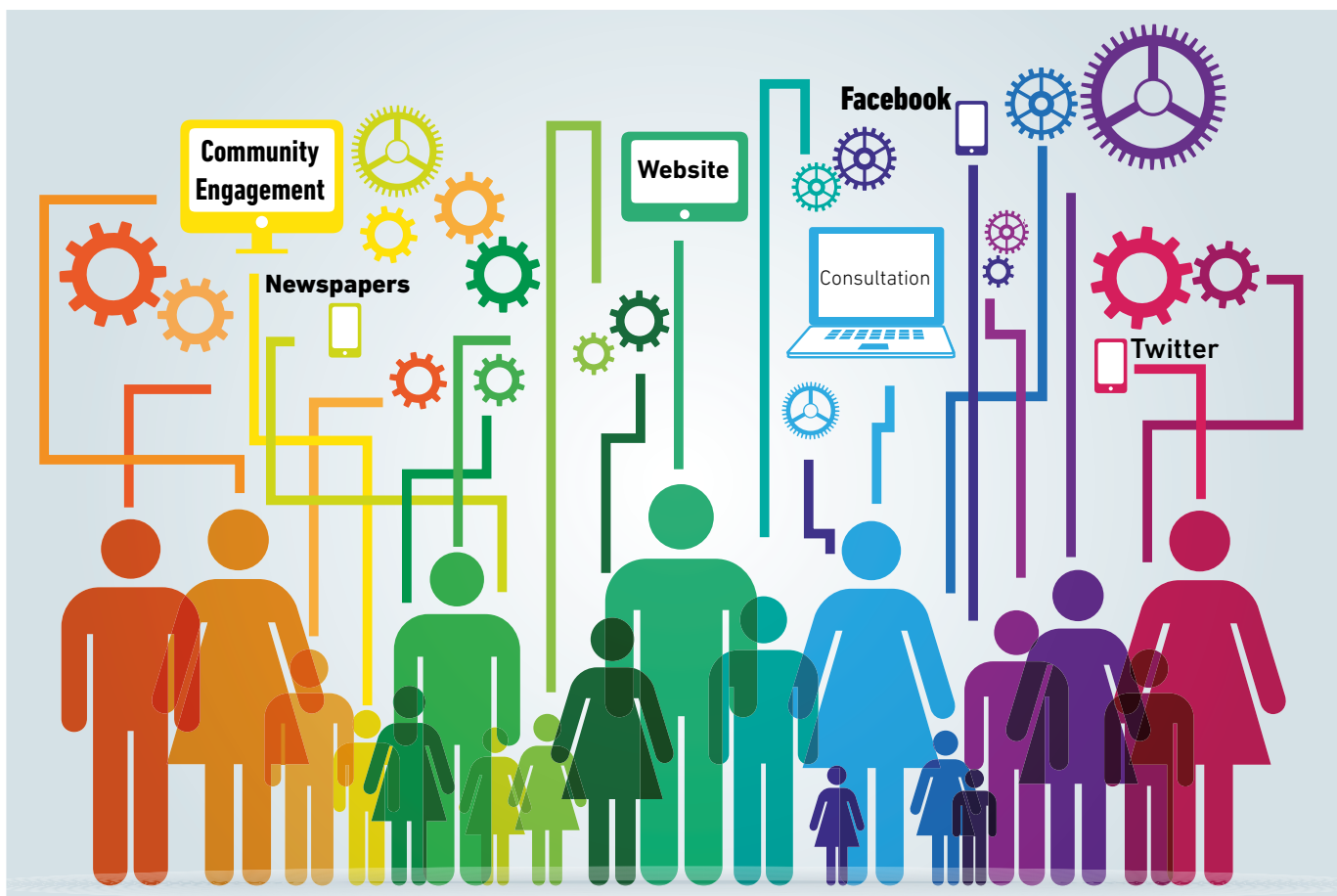
Table 1: Engagement and consultation methods for Local Plans