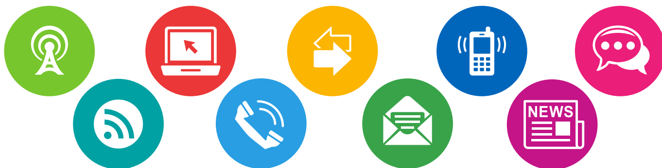
Table 2: Engagement and consultation methods for Supplementary Planning Documents