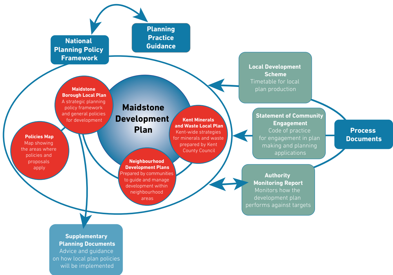
Diagram 1: Plan making